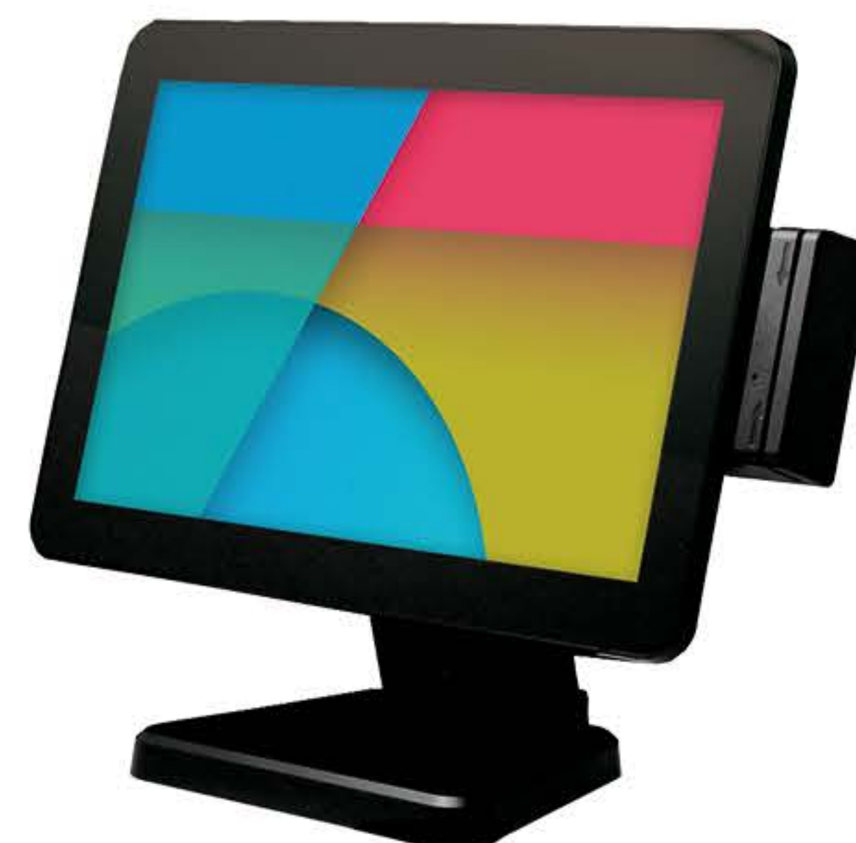
Integrated MSR (Optional)