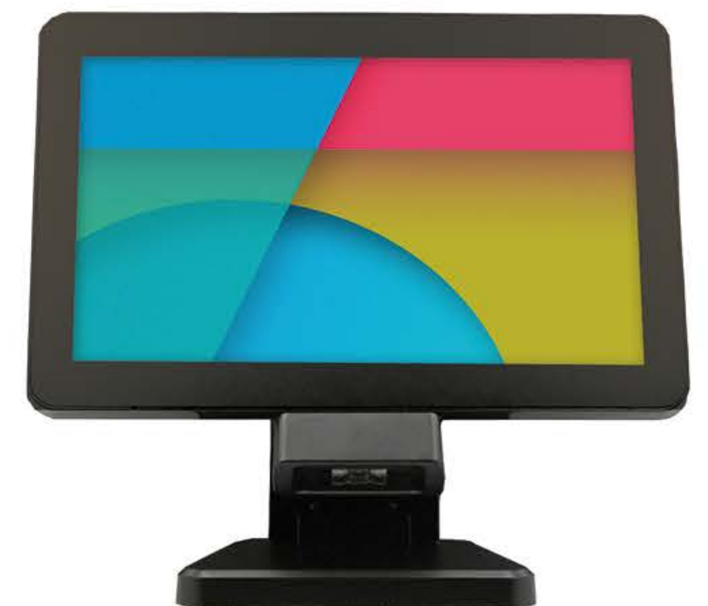
Integrated Scanner (Optional)