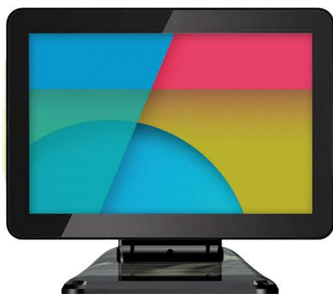
Slim Fanless Design

The TEAMSable 10P-RK Android POS terminal is the entry model to our innovative line of Android based POS products. The 10P-RK comes loaded with features wrapped in a modern, stylish design that is sure to complement any POS installation. Its 10 point PCAP touchscreen offers best-in-class performance, and at its heart is a A9, QuadCore 1.6GHz CPU that can handle most POS applications. If you want to add value and functionality to any business, 10P-RK would definitely be a smart choice for a cost-effective POS terminal.