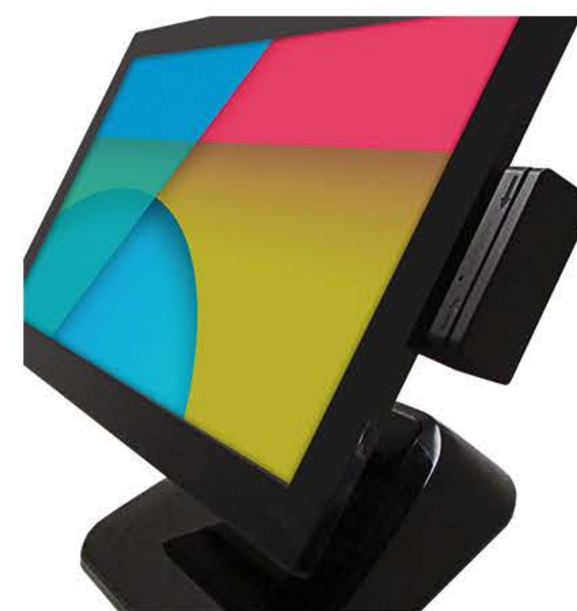
Integrated MSR (Optional)