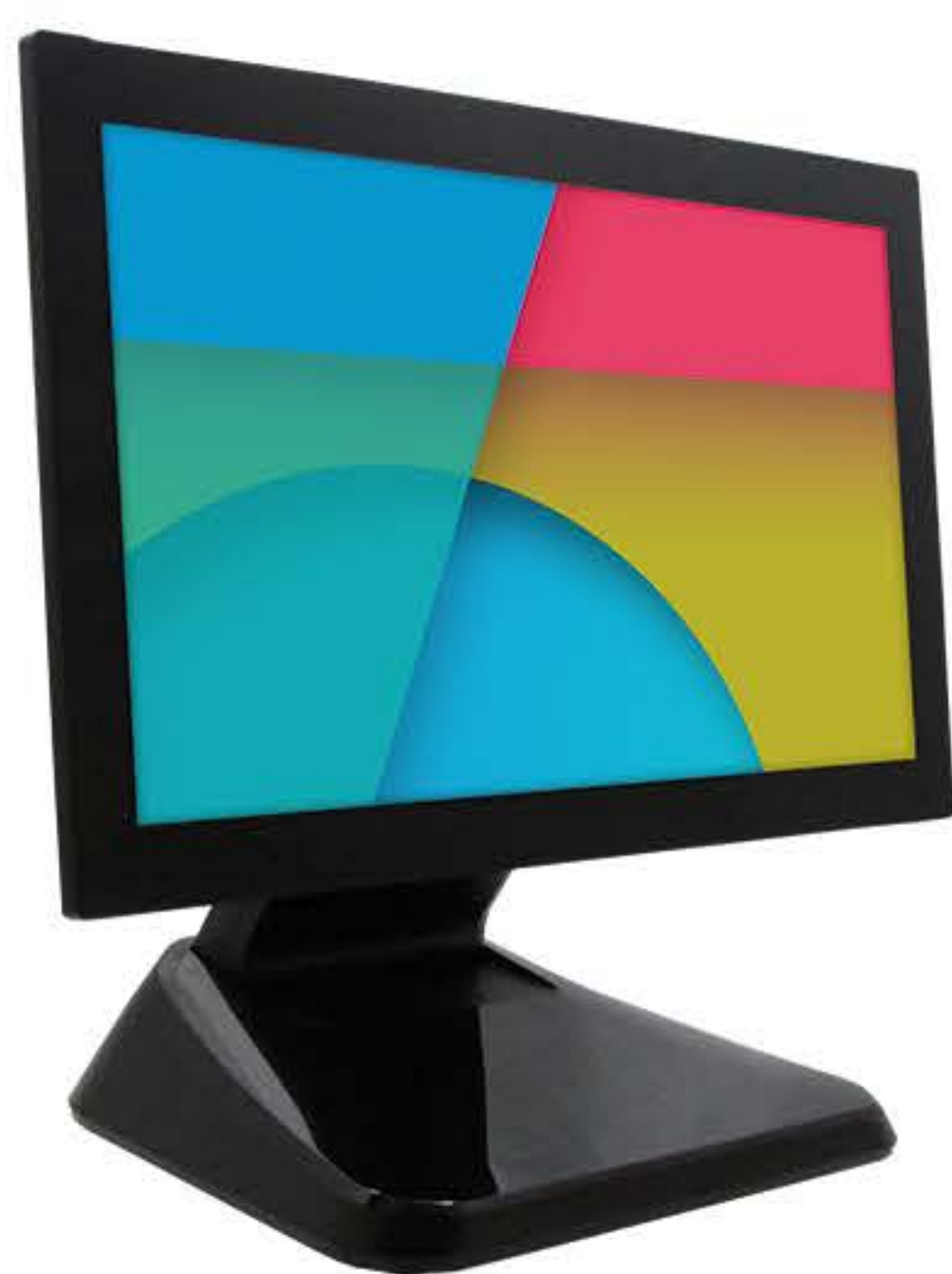
Slim Fanless Design

The TEAMSable 15N-RM Android POS terminal is the newest addition to our innovative line of advanced Android based POS products. The 15N-RM comes loaded with features wrapped up in a modern, stylish housing that is sure to complement any POS system install. Its 1080P high resolution PCAP touchscreen offers best-in-class performance, and at its heart is a blazing fast A17, Quad Core 1.8GHz CPU that can easily handle the most demanding applications. The 15N-RM is a smart choice for a cost-effective, high performance POS terminal that adds value and superior functionality to any business.