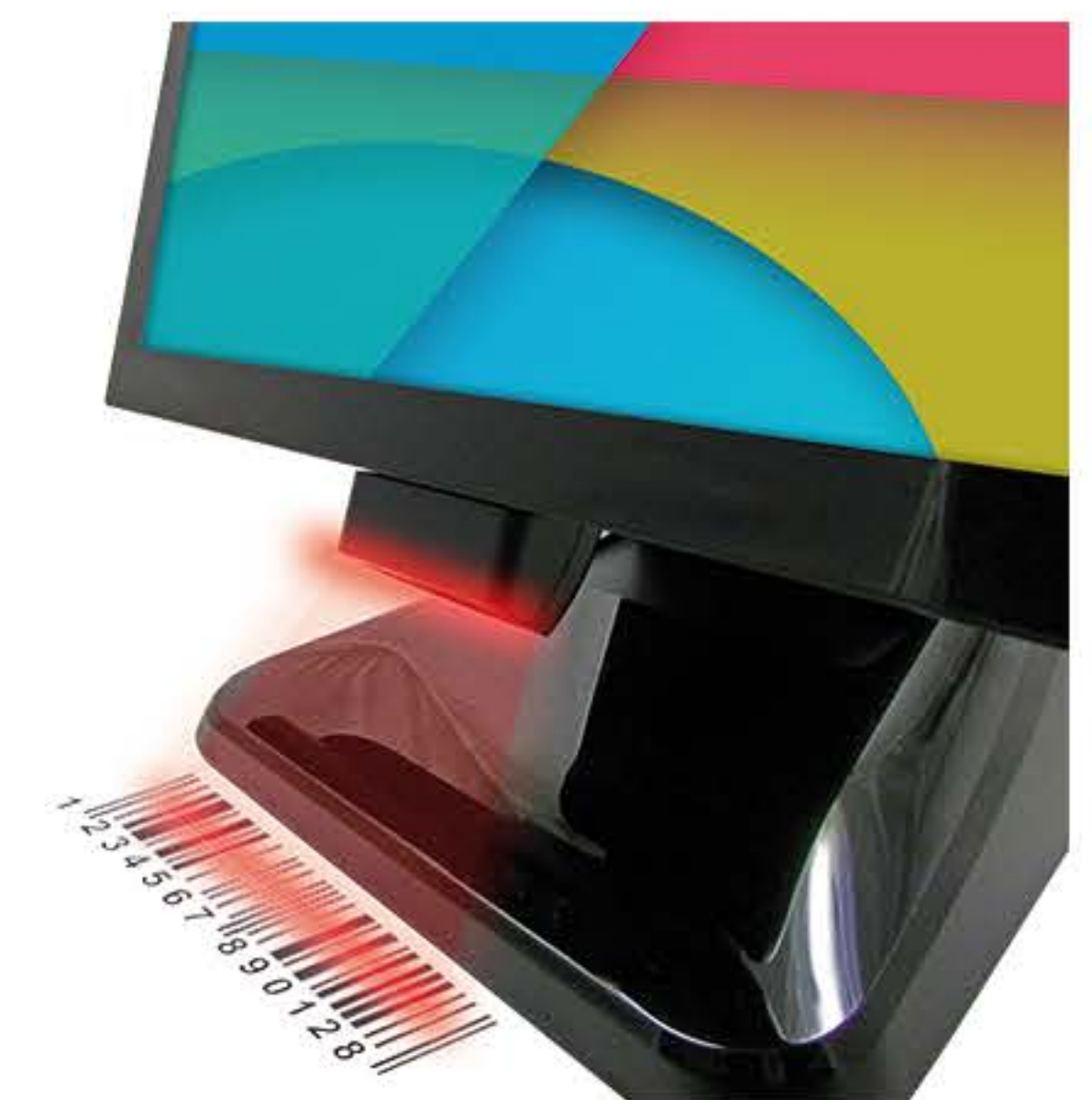
Integrated Scanner (Optional)