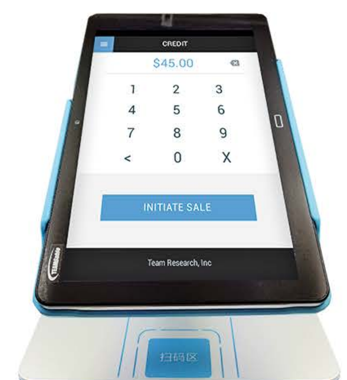
Customer Facing Application