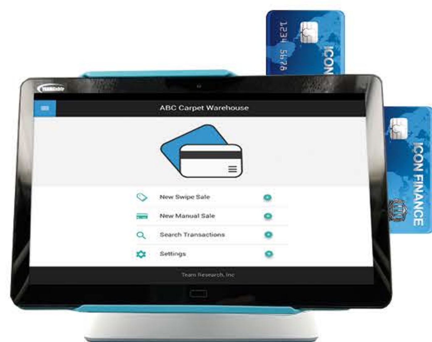
Integrated EMV & MSR