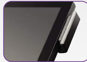
Magnetic Card Reader