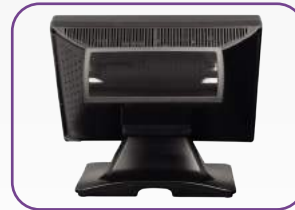
2x20 VFD Display