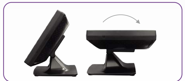
Wide Adjustment Angle