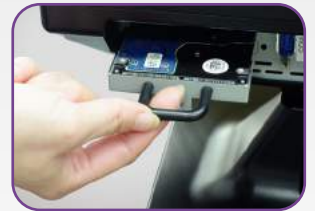
Easy Access HDD Bay