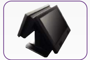
2nd 7" or 10" Display