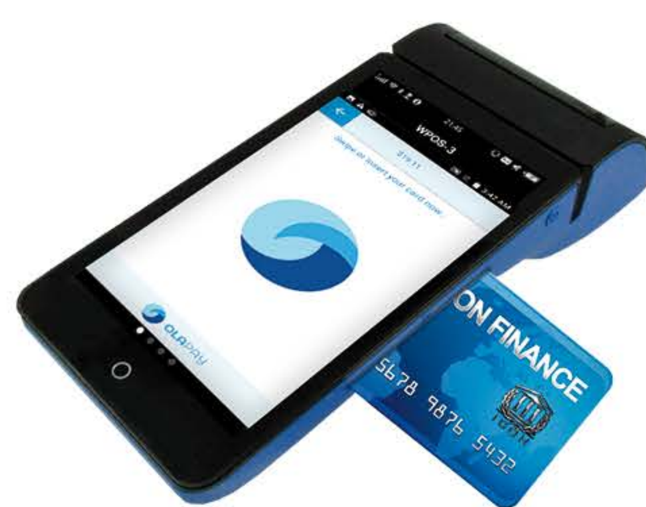
Integrated EMV Reader