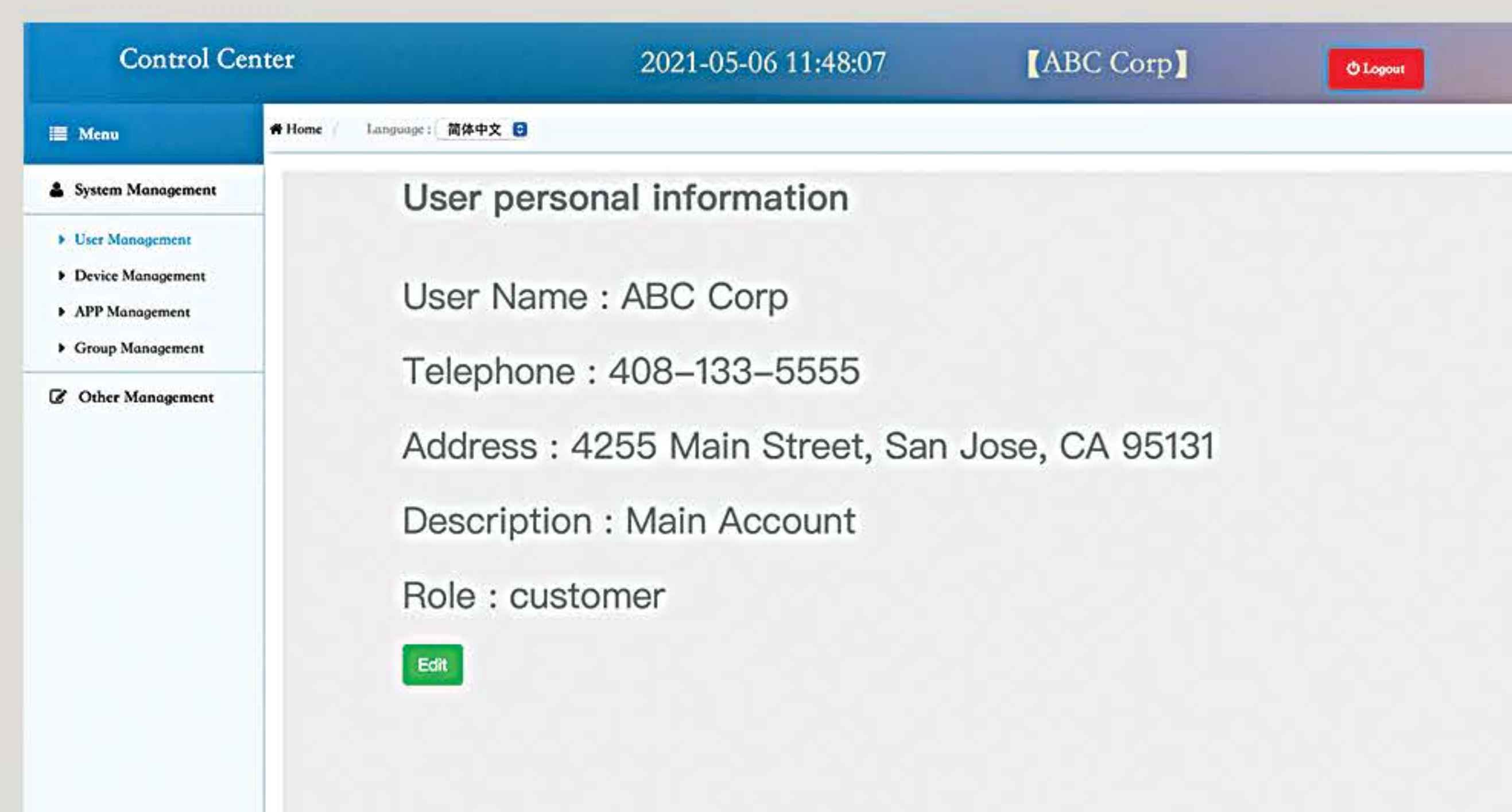
1. User Management

With TEAMSable as your Android™ hardware channel partner, you can deploy point of sale, unattended retail (kiosk) and digital signage devices all from one convenient source. You can rely on our after-sales value-add services to keep your clients' businesses humming with our free MDM service and free lifetime technical support. TEAMSable has what it takes to keep your Android™ hardware operational and updated for any mission-critical systems.