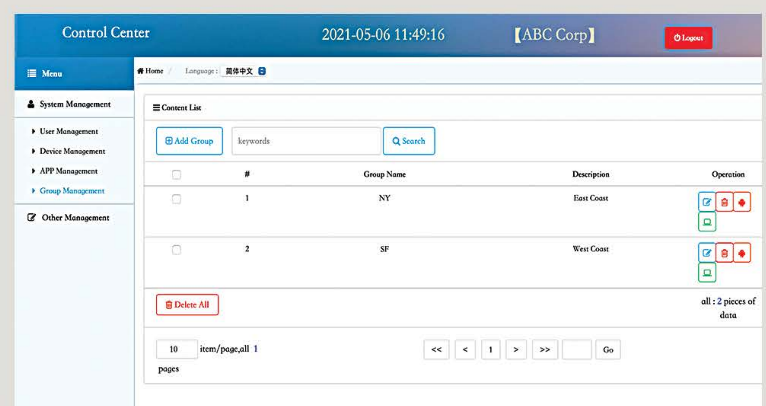
4. Group Management