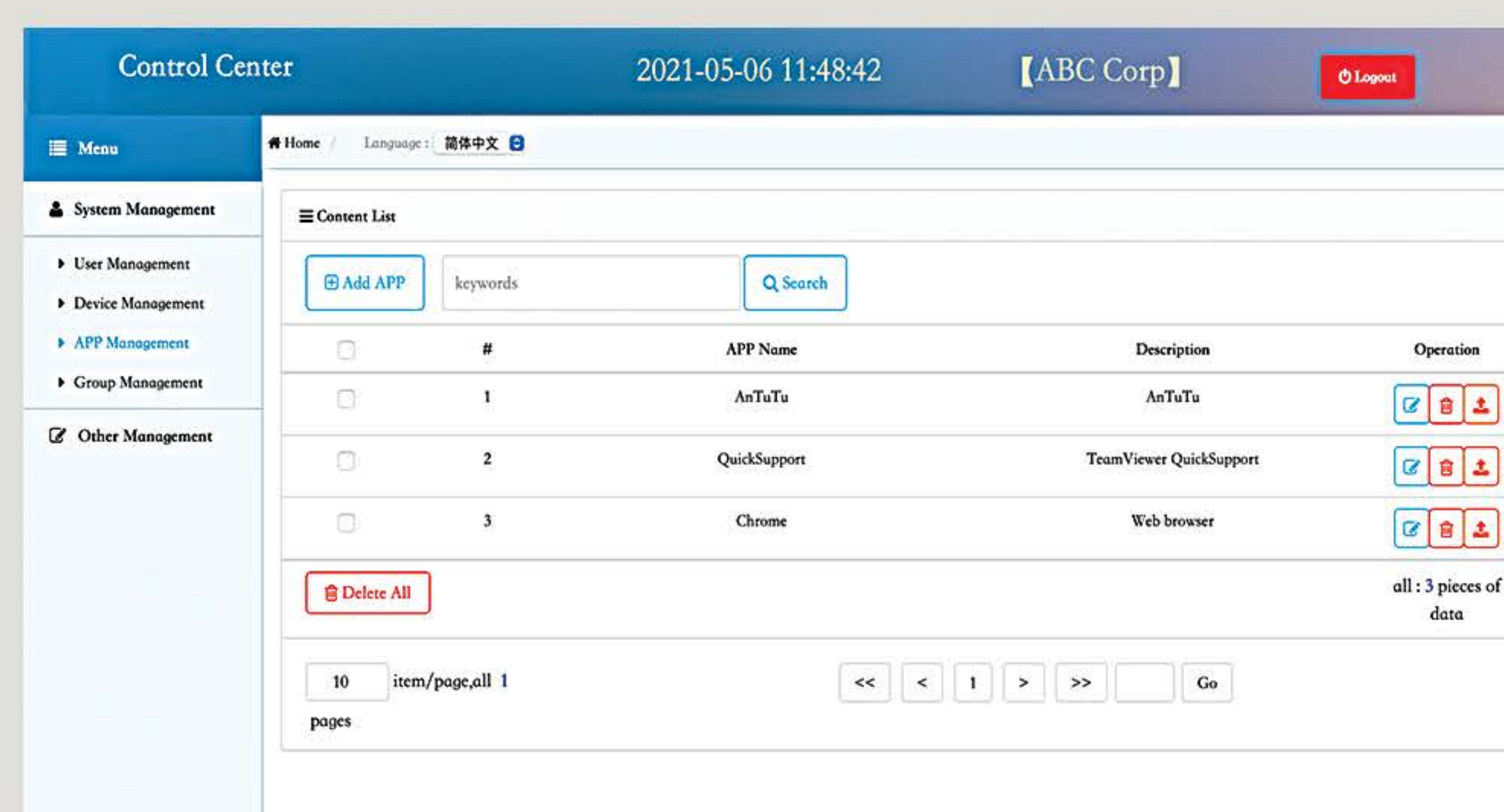
3. APP Management