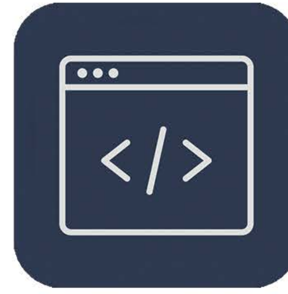
Windows API Availbale