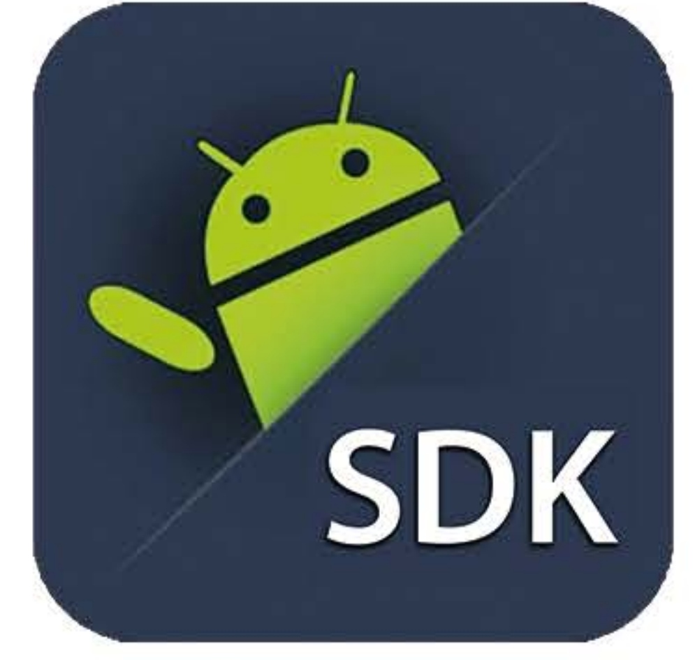
Android SDK Availbale