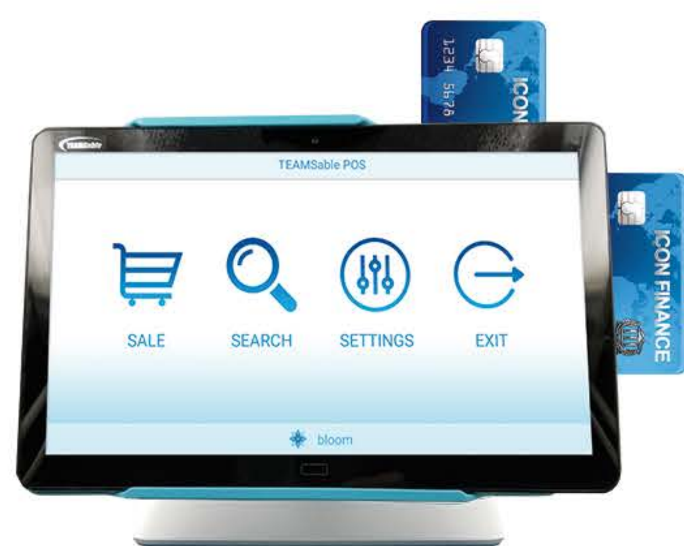
Integrated EMV & MSR