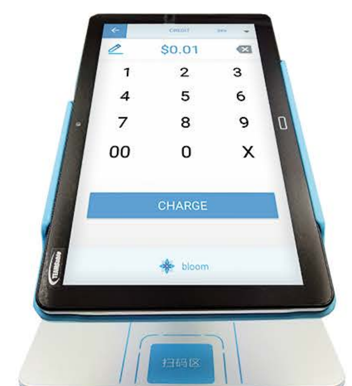
Customer Facing Application