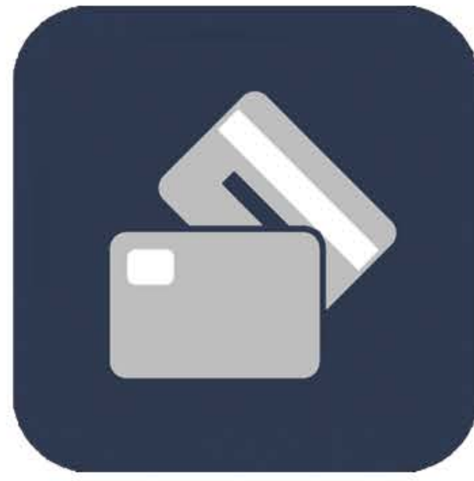
Certified EMV & PCI