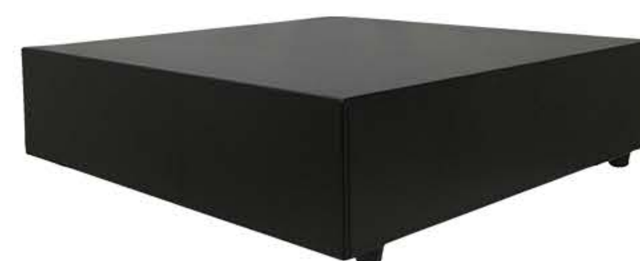
Integrated MSR (Optional)