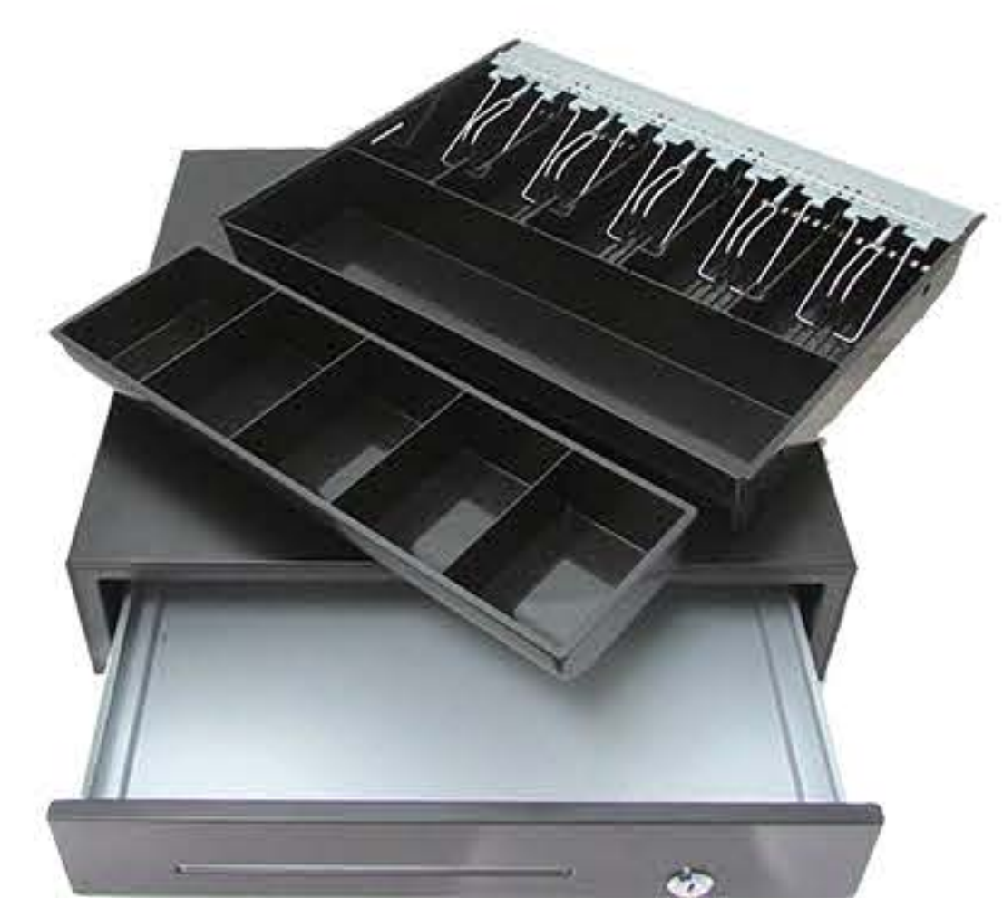
Integrated Scanner (Optional)