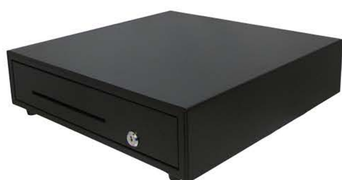
Slim Fanless Design