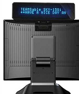
Integrated 2x20 Line Display