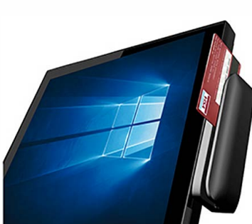
MSR Reader (Hardware key-injectable)