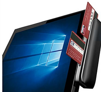
MSR/EMV Combo Reader