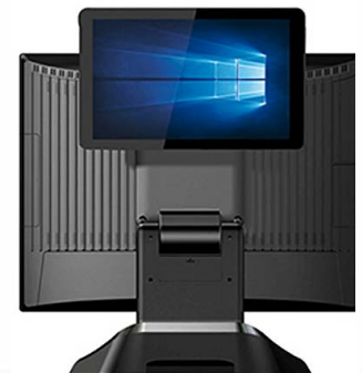
Integrated 10" Customer Display