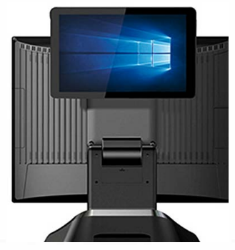
Integrated 10" Customer Display