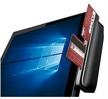
MSR/EMV Combo Reader