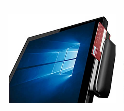
MSR Reader (Hardware key-injectable)