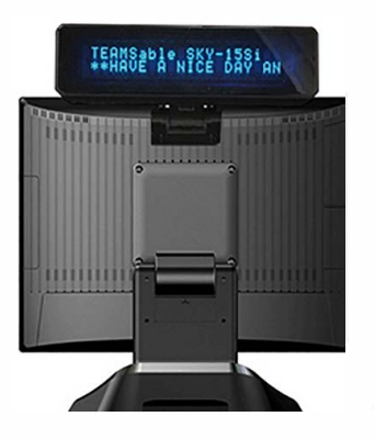
Integrated 2x20 Line Display