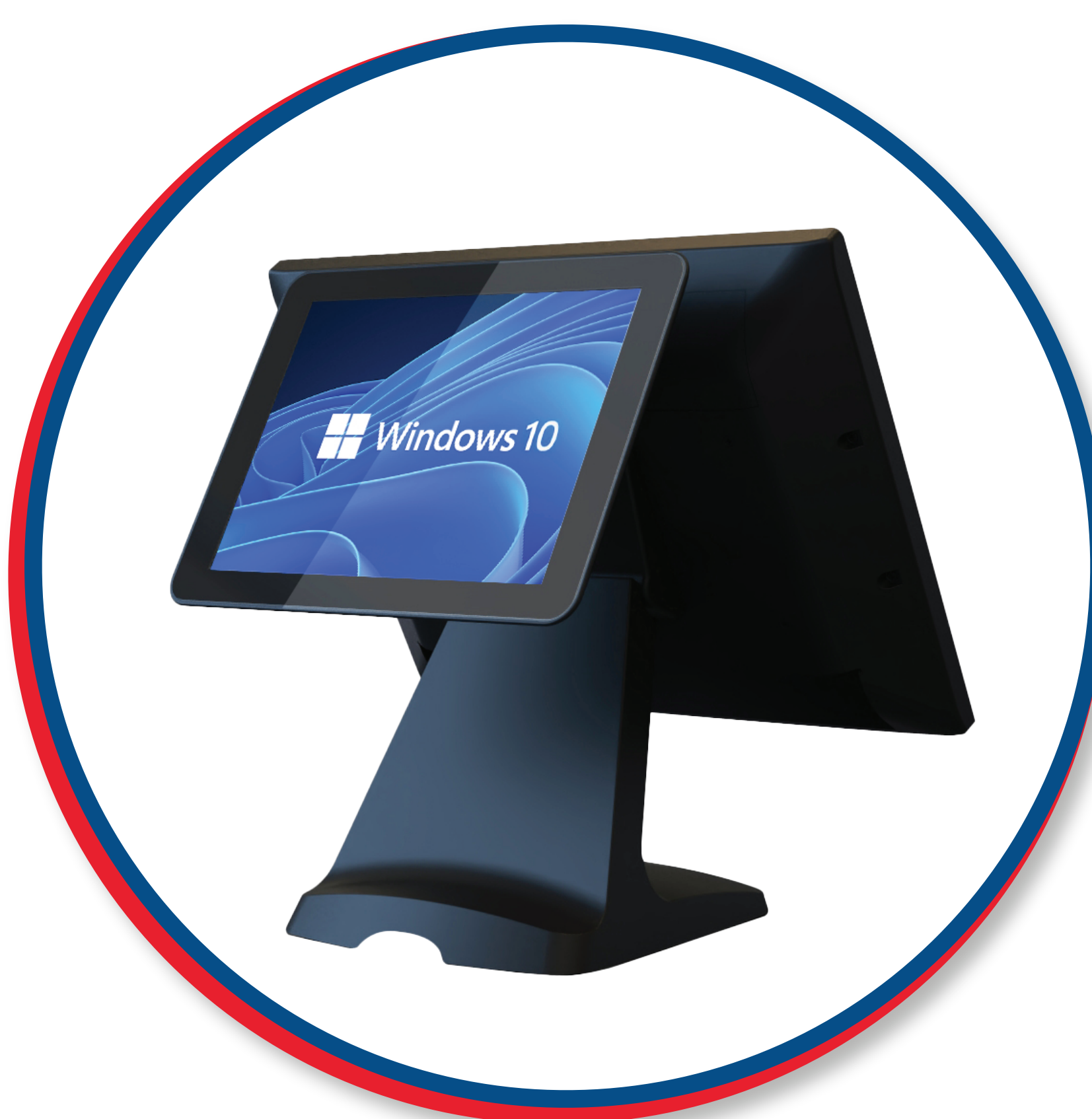
Integrated 2nd Monitor