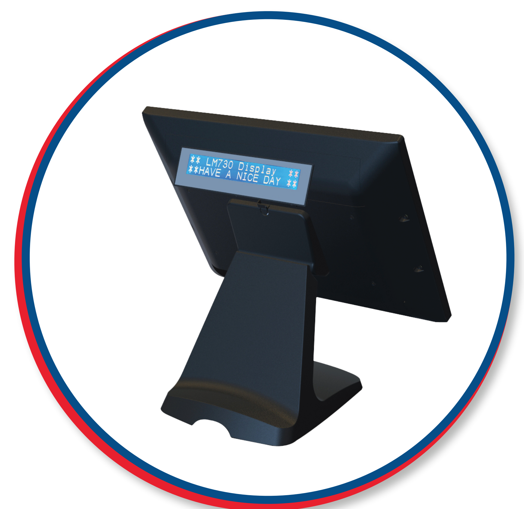
Integrated 2x20 Display