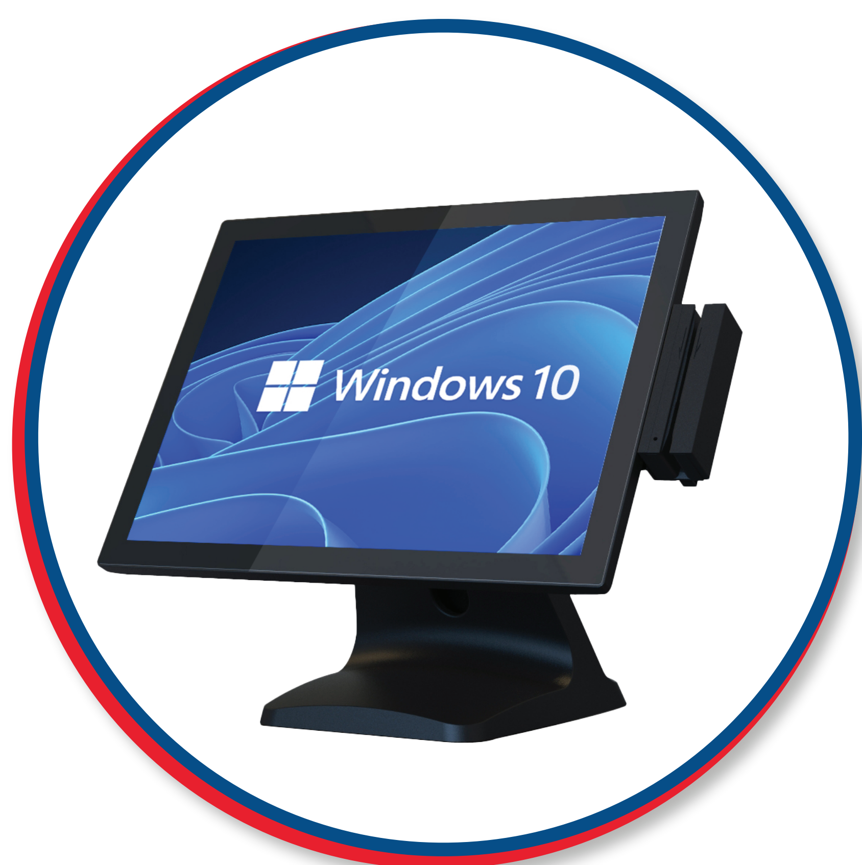
Integrated PCI MSR

Contact us today to learn more about this industry-leading POS system.