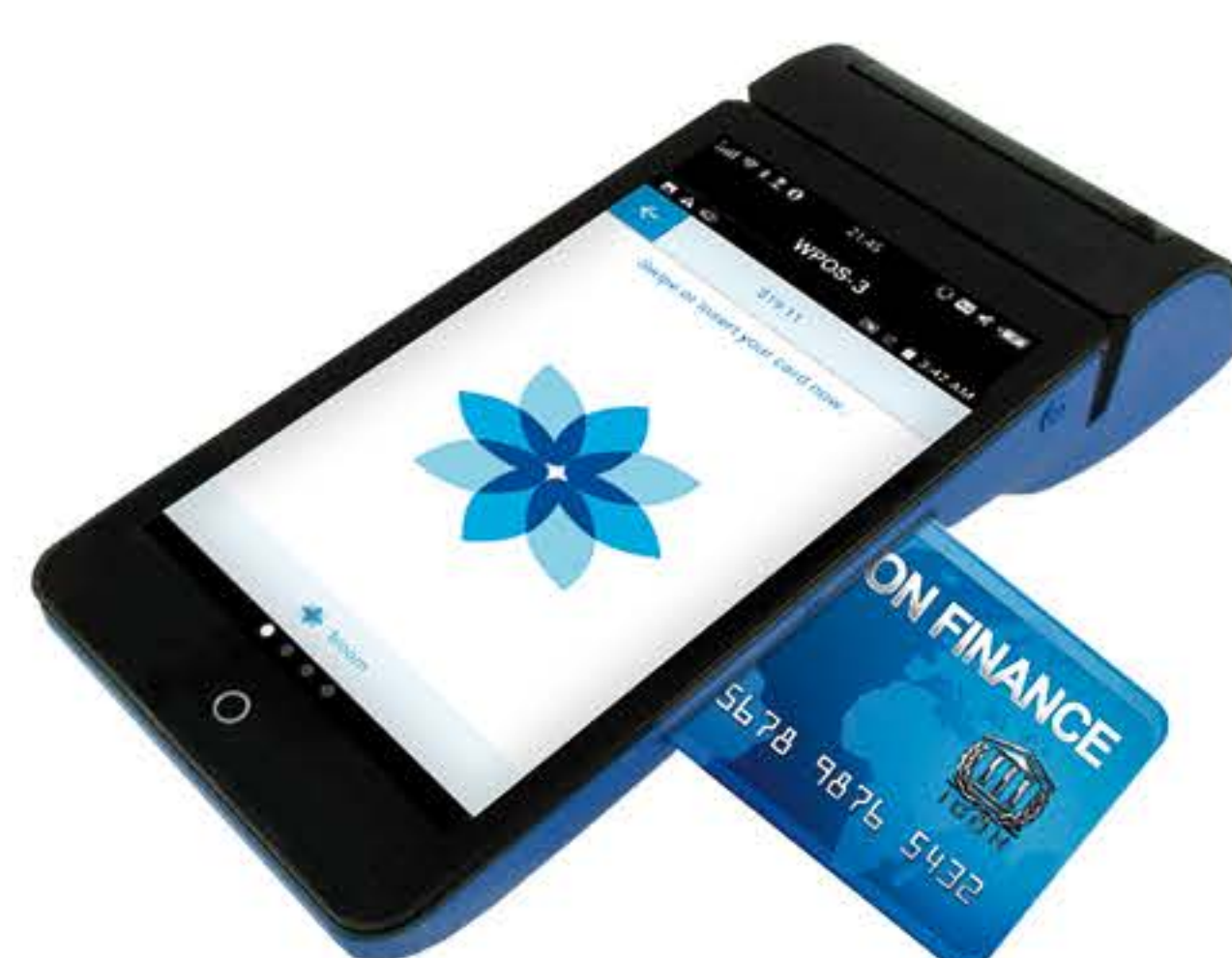
Integrated EMV Reader